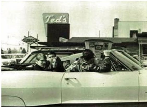
Ted's Drive In: A cruising destination for decades.